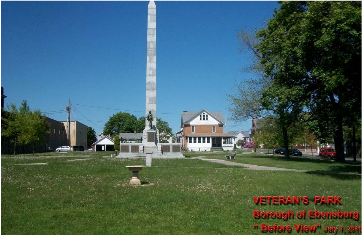
VETERAN'S PARK Borough of Ebensburg " Before View" July 1, 2010