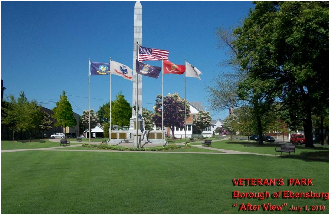
VETERAN'S PARK Borough of Ebensburg " After View" July 1, 2010