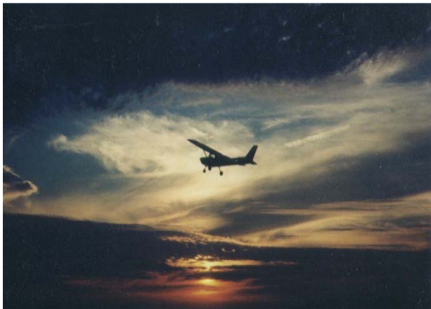
Student's First Solo out of Ebensburg Municipal Airport

The airport also provides an emergency landing strip for transient aircraft and a base for flights for the Department of Forestry and area utility companies' surveying crews.